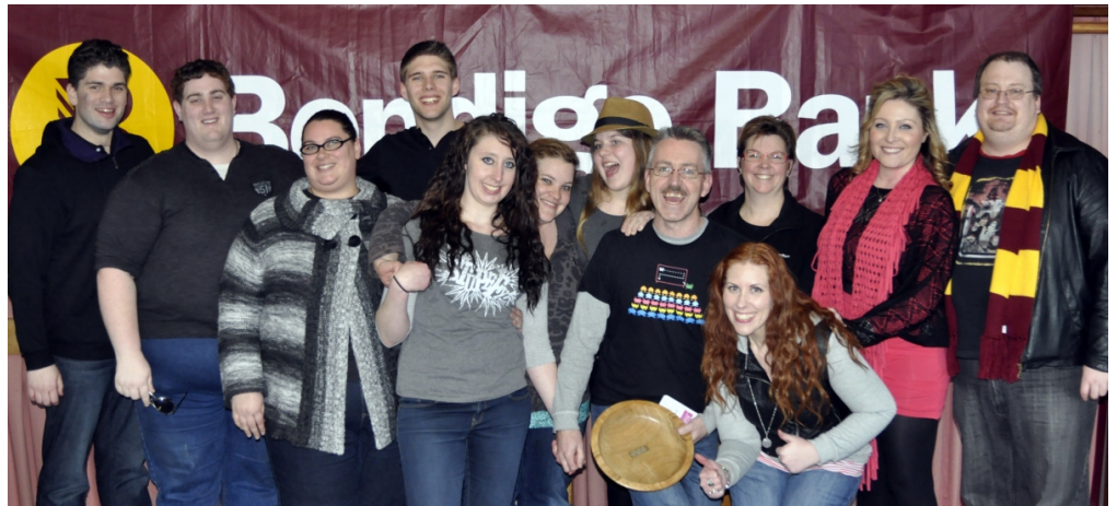
The happy crew from Pop Culture Theatre, winners of the Bruce Crowl Award for their slick and hilarious staging of 'The Seven Deadly Sins'.

'Fawk' was the runner up play with a dazzling display of physical theatre and Shakespearean language. Staged by Nuworks Theatre Company, 'Fawk' also captured awards for the Male Leading Actor, Support Actor, Youth Performance and the Design Award.