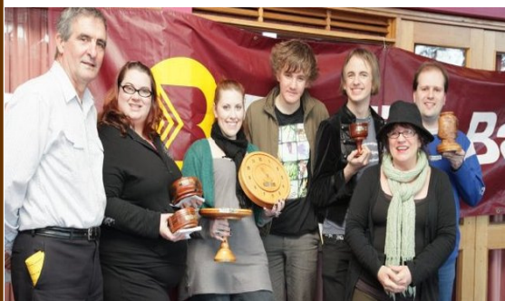
Last year's winners. Who will be taking home the prizes in 2011?

You can see new plays, support your friends, meet new people and be thoroughly entertained.