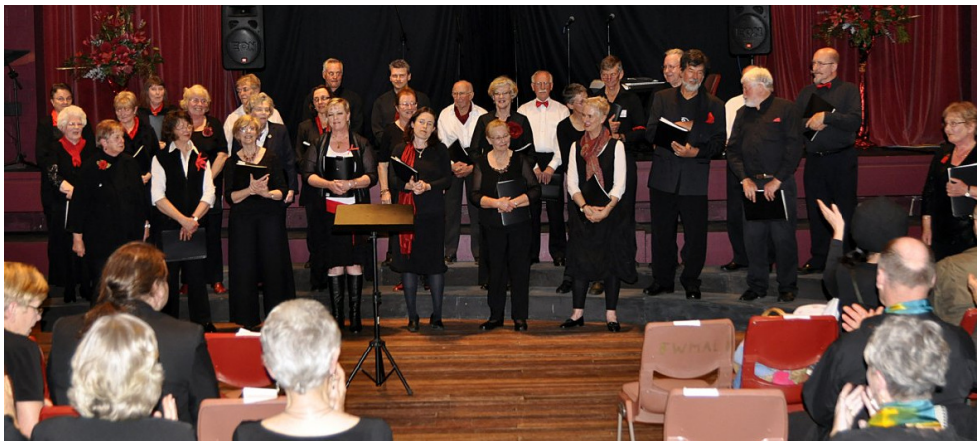
The Prom Coast Singers at the Saturday night concert